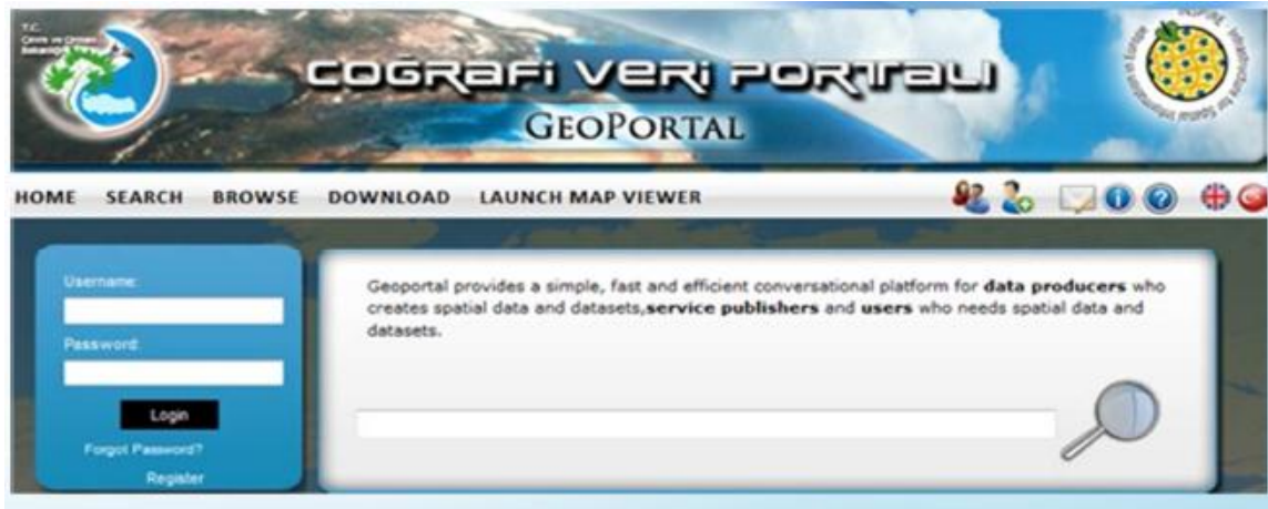
Figure 2: The geoportal allows to search/discover, view, download and use spatial data (Serter, 2011).